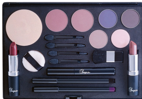
Dusty Rose 104